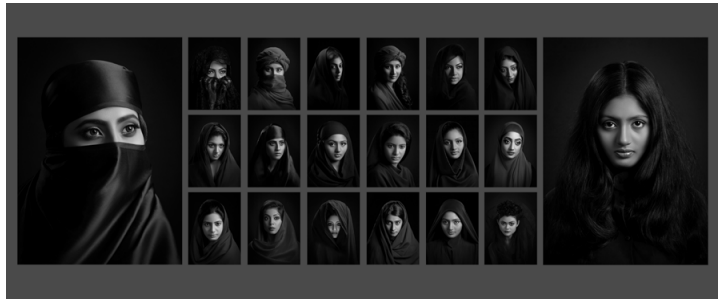
An example of MFIP Viewing plan

The application will be refused if the applicant's name, exif data, copyright symbol, logo, or any other identifying mark or the title of the Portfolio, title of the individual photograph is displayed on the Viewing Plan image.